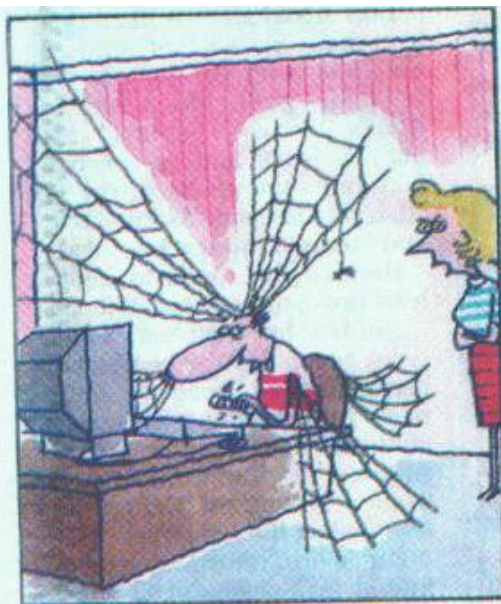
"I THINK YOU'VE BEEN SPENDING ENTIRELY TOO MUCH TIME ONLINE!"

The URL for the Live Meeting Training for Sat, Dec 18 5pm EDT, 4pm CDT, 3pm MDT, 2pm PDT is here . Before you attend you will need to have downloaded the client from here and checked to be sure it is working here